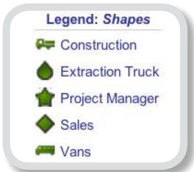
Custom Vehicle Shapes

GPS Insight to always send the best option to a job site. According to VanVladriken, "We use the GPS Insight custom icons as vehicle identifiers for our Water Trucks, Recon Trucks, Project Managers, and Sales to identify the appropriate vehicle for the job and then from there, put the address in the 2D current map to get the closest ones. Following that we will dispatch the vehicle to the location based upon their availability."