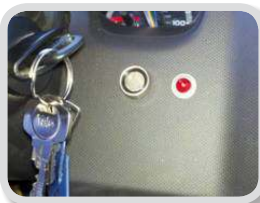
Driver ID Key Fob Receiver

Nubilt uses the GPS Insight Driver ID functionality to know which employee is driving which vehicle. "We wanted a feature where the employees could be individually tracked, not just the vehicle, and having the ability to implement the Driver ID key fobs was ideal." This is beneficial for payroll, driver behavior coaching, and accountability.