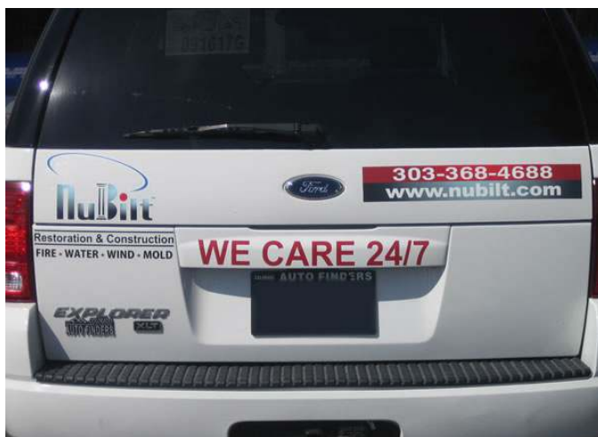
NuBilt vehicle tracked by GPS Insight

Business Challenge: NuBilt knew that they needed to reduce their high fuel cost. In order to do this, they needed a tool that would show them how their vehicles were being used. The company also needed a way to tell when employees arrived and left jobsites and their overall whereabouts throughout the day. Most importantly, NuBilt needed to improve dispatching to ensure that their two hour response time guarantee was upheld.